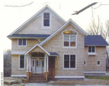
Figure 3. While not perfectly symmetrical, the window placements on the shingle-style house above have a pleasing balance. The windows below the gable peaks are focal points that provide a feeling of "centeredness." The irregularly spaced windows in the side elevation (right) are visually unified by the use of a strong eaves line and a flared belt course midway up the wall.

A nonsymmetrical window layout can sometimes be balanced by using a door or pair of doors as a visual "pivot point." As long as the windows are arranged in a simple, regular pattern, they don't need to be centered on a facade to provide a sense of overall consistency (Figure 4).