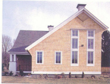
Figure 5. An ornamented peak and projecting "rooflet" over the stacked windows adds a sense of unity to a side elevation that might otherwise seem disorganized and chaotic.

The windows themselves are another important factor. If the general window type used throughout a given house — such as 6-over-1 double-hungs, cottage-style windows, or fully mantined panes — is rigorously consistent, variations in size and location of the windows become much less distracting.