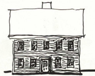
Figure 1. This sort of symmetrical front elevation worked well in the 1800s, and it's a look that remains popular today. Window layout provides few problems, as long as the street-facing walls of the front rooms are free of window-obstructing interior elements.

If the client wants a traditional centered home shape, the facade that faces the street typically has the expected symmetrical window layout (see Figure 1). But almost invariably, the perfectly centered street-facing windows give way to more eccentric placements at the sides and rear, where large areas may have no glass (think closets, mechanical spaces, food storage, and major appliances), while other areas, such as family rooms and master bedrooms, often give themselves completely over to glass (Figure 2). The result is a visual disconnect between the home's classically centered public face and the less orderly arrangement of windows at