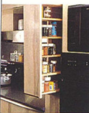
12 A roomy spice rack next to the stove rolls out for quick access.

close to the family room handles cleanup chores. The smaller sink next to the herbs is for food preparation. Lines of sight. Floor levels step up from the cooking side to the family side to the platform by the computer desk. This helps kids see eye to eye with parents.