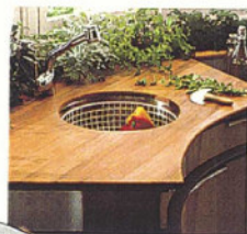
10 A raised teak chopping surface next to the herb garden is easy on your knees and your back.