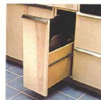
13 Cookie tins and foil objects store neatly in this cabinet just an arm's reach from the oven.

Recycling center. Four recycling bins built into the bottom of the pantry cabinets easily hold a week's worth of recycled goods for the average family. Heavy-duty drawer glides ensure smooth, tilt-free opening and closing