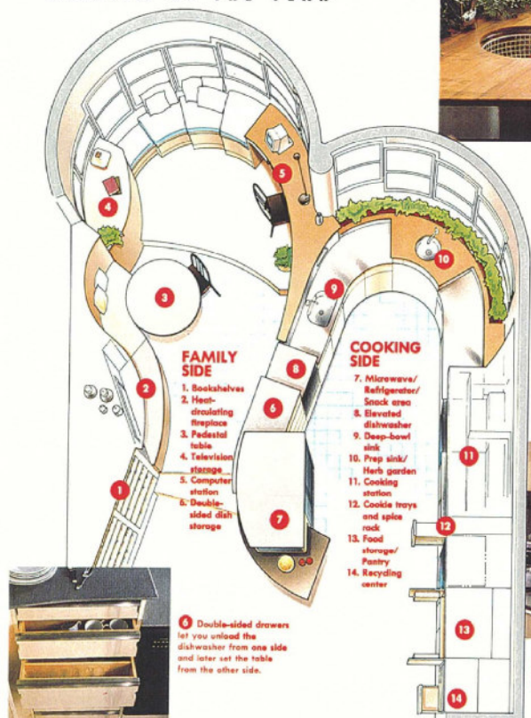
6 Double-sided drawers let you unload the dishwasher from one side and later set the table from the other side.