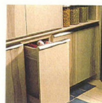
14 Built into the cabinets, four recycling bins hold a week's worth of goods and roll out smoothly on heavy-duty glides.