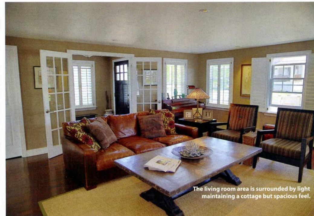
The living room area is surrounded by light maintaining a cottage but spacious feel.

Babies were thus given beds, and the couple remodeled the main floor waterside of the home in 2002. A muddled existing waterside first floor was cleaned out, creating sweeping views of the harbor by moving a bathroom, while the tiny