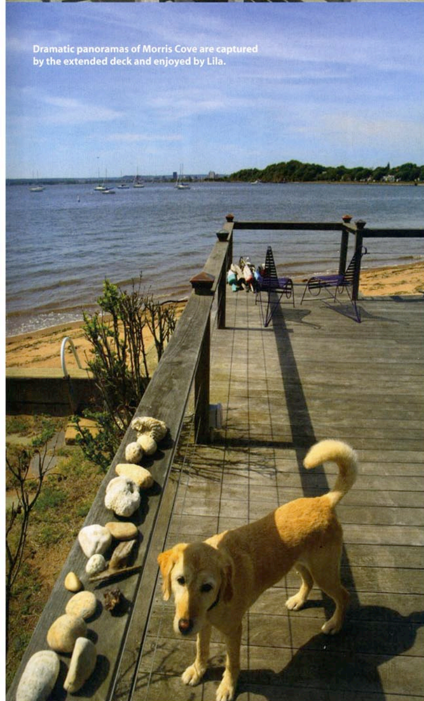
Dramatic panoramas of Morris Cove are captured by the extended deck and enjoyed by Lila.

and installing the in-ground pool with granite patio.