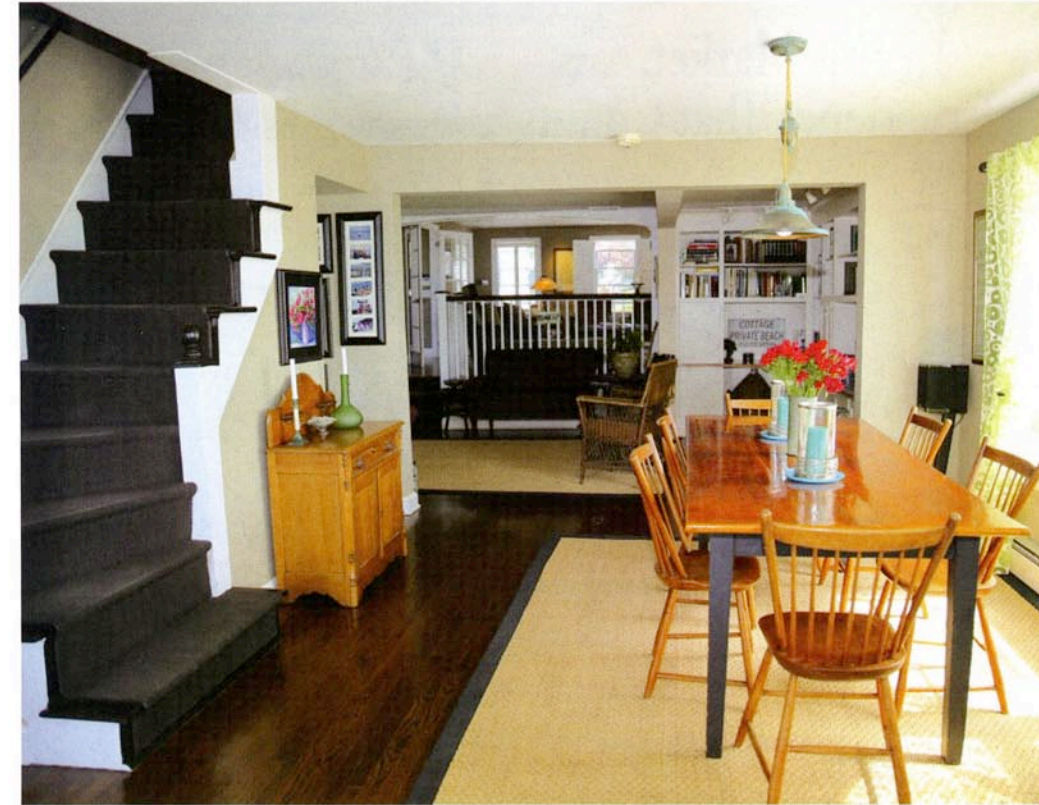
Living/dining area: The original stair remains (at left), grandfathered into code compliance, while a new street-facing family room (right) must be set at the elevated code-compliant height.

the shore have evolved from nonexistent to imposing many layers of local, state and federal regulations on anyone daring to try to build anything. So the new space had to meet 1999 standards for structure and elevation above sea level. This meant the new streetside half of the house is built about 30 inches higher than the existing cottage floor levels.