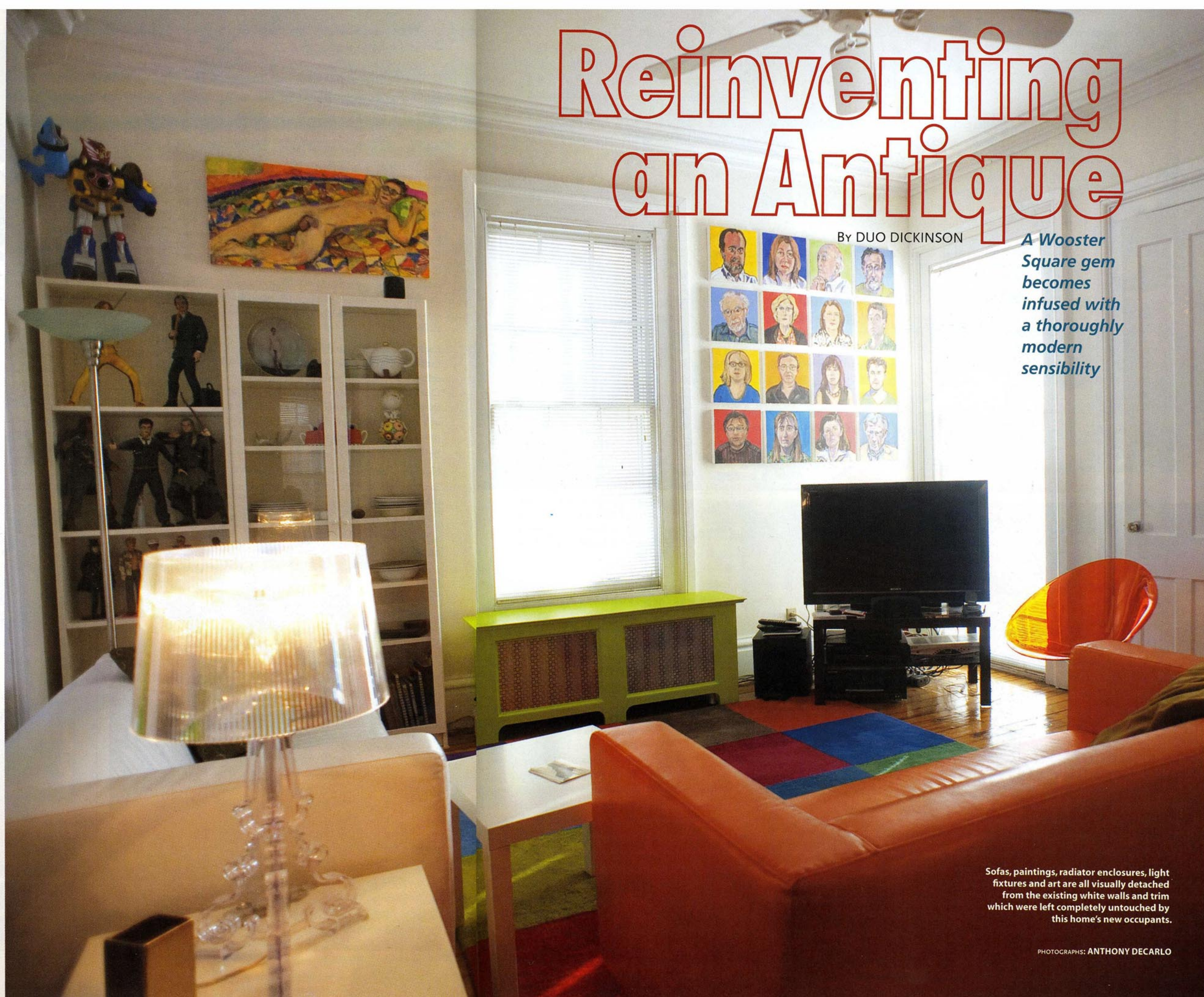
Sofas, paintings, radiator enclosures, light fixtures and art are all visually detached from the existing white walls and trim which were left completely untouched by this home's new occupants.

A Wooster Square gem becomes infused with a thoroughly modern sensibility