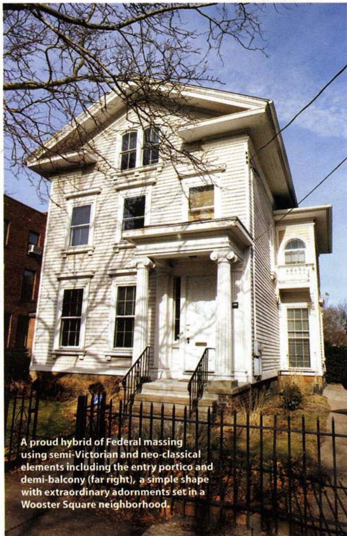
A proud hybrid of Federal massing using semi-Victorian and neo-classical elements including the entry portico and demi-balcony (far right), a simple shape with extraordinary adornments set in a Wooster Square neighborhood.